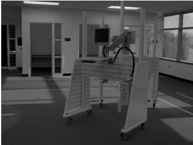
Figure 1 Picture of the vertical workstation (treadmill not shown).

cated office equipment, evaluation equipment and is temperature controlled and silent.